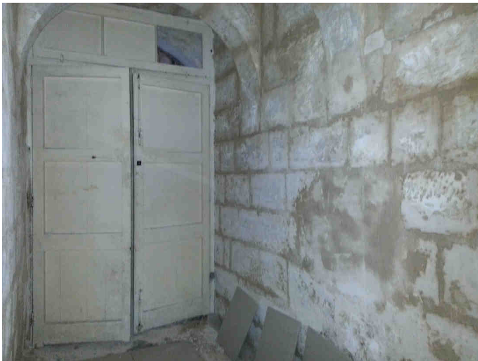
Above: Site A: Location 2