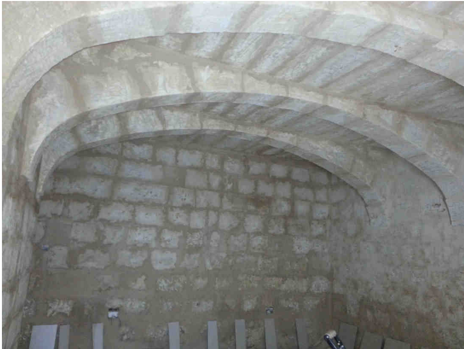
Above: Site A: Location 3