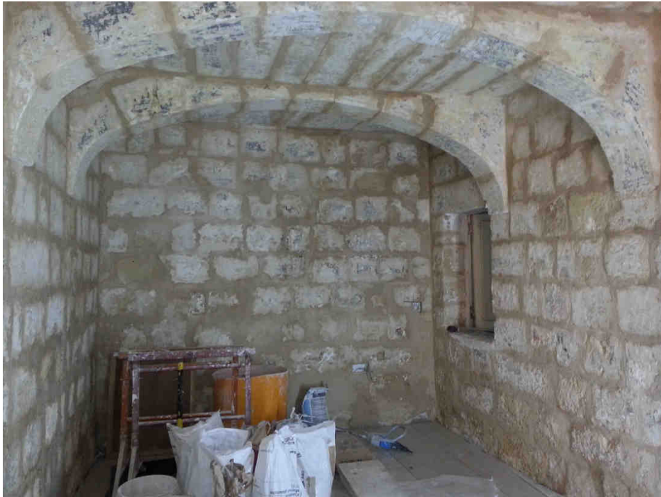
Above: Site A: Location 1